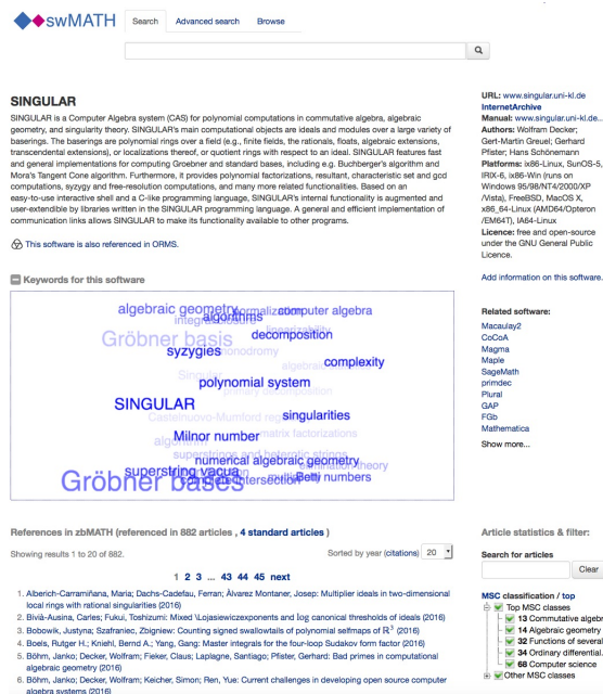
Figure 6: A snippet of the swMATH webpage for the software “Singular”.

Each CAS is presented by an own webpage, see, e.g., a cutout of the swMATH webpage for the software “Singular” in Fig. 6.